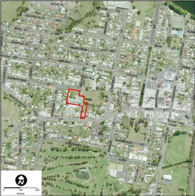
Figure 1: Locality Context