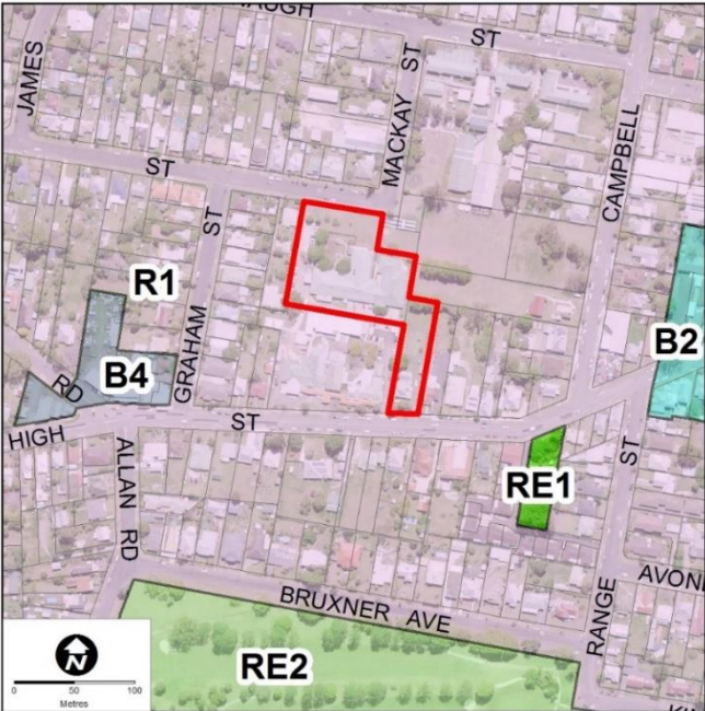
Figure 2: Site Context